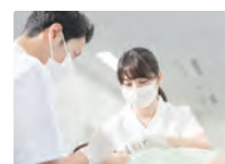
Dental treatment assistance Provide support to dentists