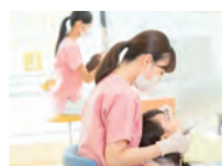
Dental prophylactic treatment Preventing "tooth decay" and "periodontal disease"