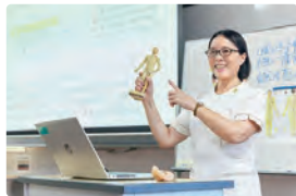
Chinese Medicine 中医学

Through unique courses based on the Buddhist spirit, students will learn various ways of perceiving life, aging, sickness, and death from a Buddhist perspective, thereby cultivating not only advanced nursing knowledge and skills but also a rich sense of humanity and ethics. In addition, through unique courses such as "Chinese Medicine," "Holistic Health," and "Gender and Health," students will learn to refine mind and body, cultivate self-awareness, develop the skills to provide compassionate, holistic care while learning essential self-care as nursing professionals.