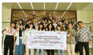
Cultural exchange with Indonesian students インドネシアの学生との交流