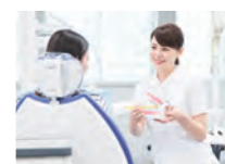
Dental health guidance Support to maintain oral health